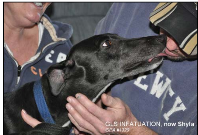
GLS INFATUATION, now Shyla GPA #1320